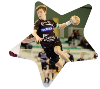
Professional clubs National championship National teams