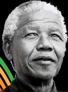
Nelson Mandela 1918 – 2013

"SPORT CAN REACH OUT THE PEOPLE IN A WAY WHICH POLITICIANS CAN'T"